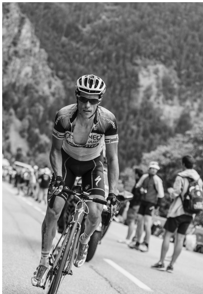
Figure 2 shows a cyclist in the Tour de France. Cyclists race for up to six hours each day for three weeks.