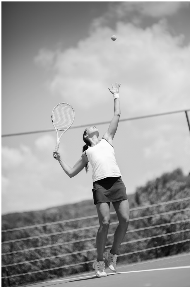
Figure 3 shows a tennis player performing a serve.

4 Skills can be classified using different continua.